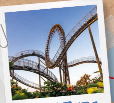
TIGER & TURTLE