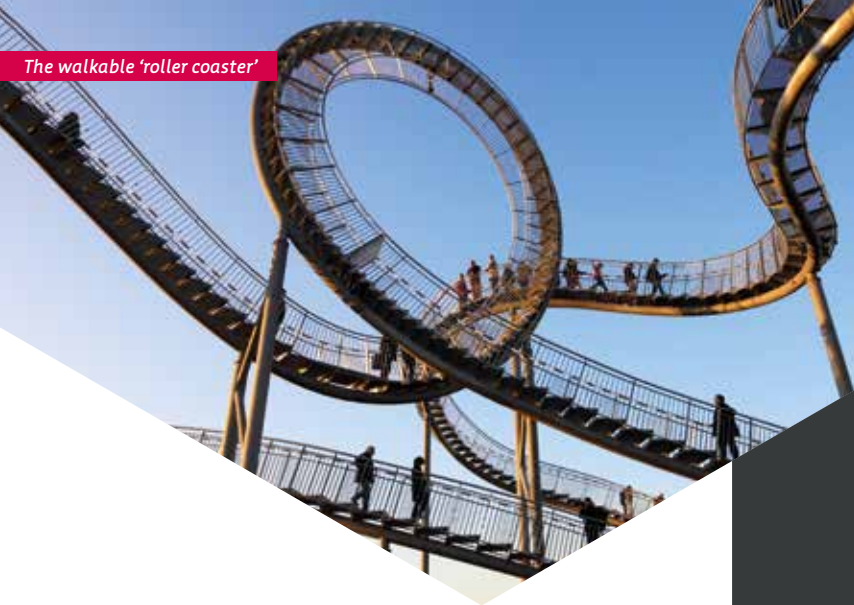
The walkable 'roller coaster'