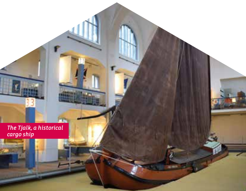
The Tjalk, a historical cargo ship

The current museum is housed in a former art nouveau swimming pool. It opened in 1910 and had two swimming halls – one for men and one for women. The house rules were strict. One particular rule stated, for example: 'Operations to remove corns may not be performed on the premises.'