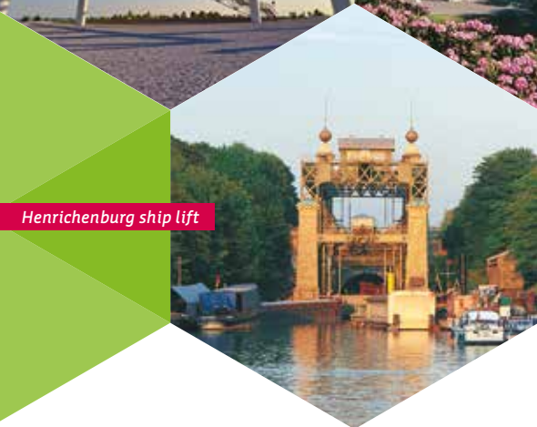
Henrichenburg ship lift