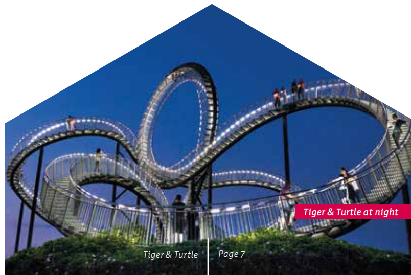
Tiger & Turtle at night

Ehinger Straße 117 | 47249 Duisburg www.tigerandturtle.duisburg.de