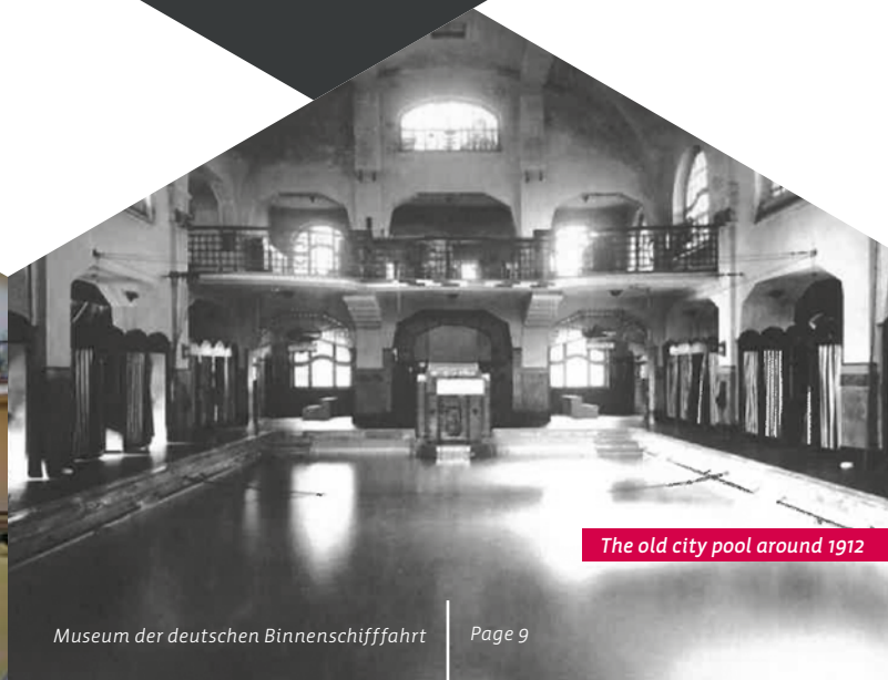
The old city pool around 1912