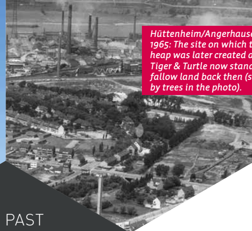
Hüttenheim/Angerhausen around 1965: The site on which the slag heap was later created and where Tiger & Turtle now stands was still fallow land back then (surrounded by trees in the photo).