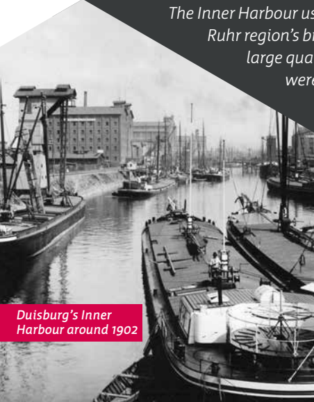
Duisburg's Inner Harbour around 1902

The Inner Harbour used to be known as the Ruhr region's breadbasket due to the large quantities of grain that were handled here. With the decline of the flour mills at the end of the 1960s came the inevitable decline of Duisburg's Inner Harbour. Work began to transform the site in the mid-1990s based on plans by the British star architect Sir Norman Foster.