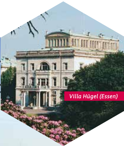
Villa Hügel (Essen)