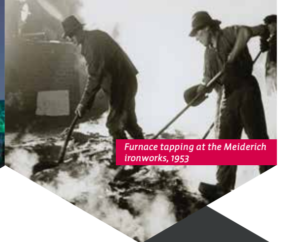
Furnace tapping at the Meiderich ironworks, 1953