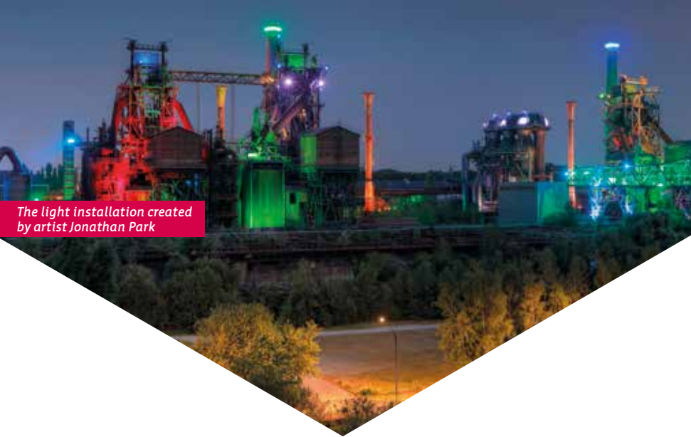
The light installation created by artist Jonathan Park